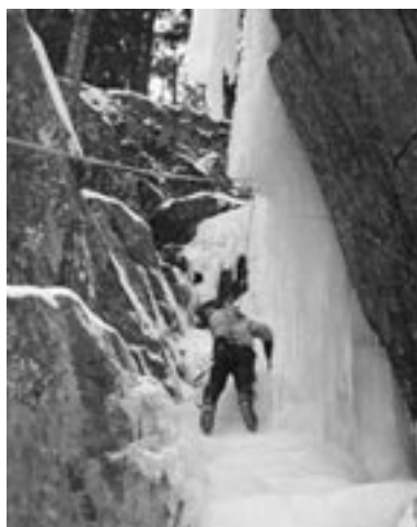
Ice climbing during January 2004 Winter Outward Bound Trip

As we stand on the cusp of the seasonal shift from winter to spring, the days for the current interns are filled with the three R's of the final third of the program: retreats, recommendations and reflections. All three of these components help interns to consciously examine what they want out of their own life and how to approach it. Without them, there is far less awareness, far less learning, than occurs simply through the actions of doing the program. This approach to learning by doing, reflection on action, is at the core of Internship Year.